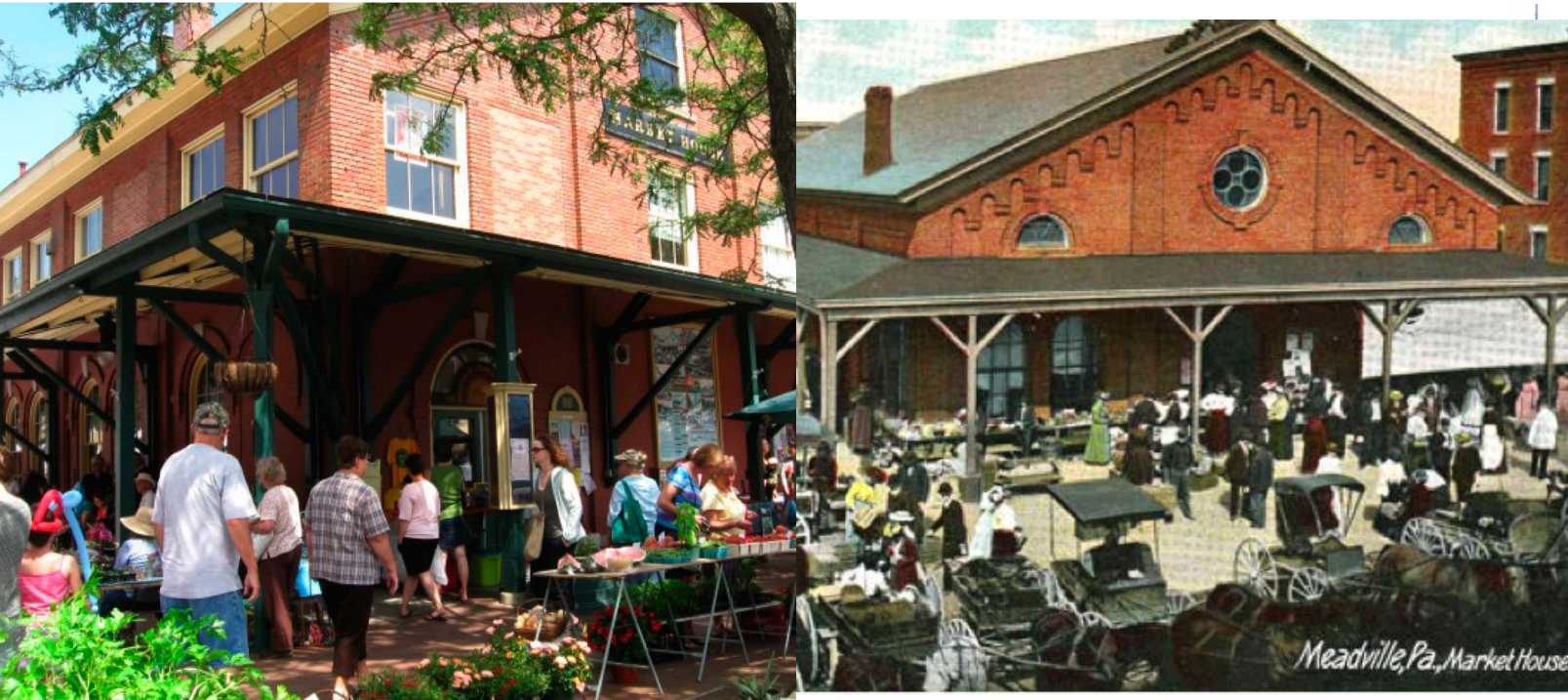
The historic Market House in Meadville, PA, has served the community since 1870. It features an indoor market space, a restaurant, and outdoor vendors who operate under an exterior canopy. A local arts center occupies the second floor