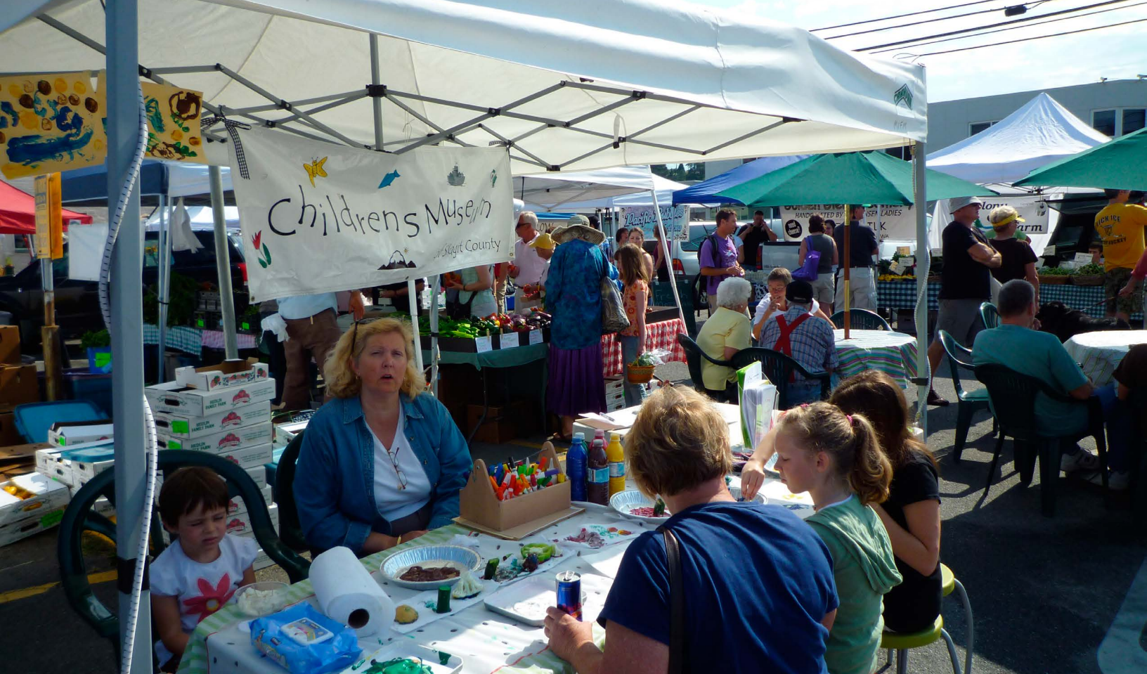
Mt. Vernon Farmers Market, Mt. Vernon, WA