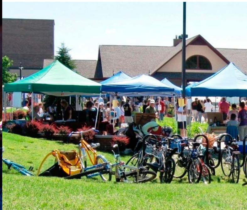
When the Marquette (MI) Farmers Market relocated from a vacant lot to a new community commons, it had a dramatic impact on business. The commons includes a community center and an adjacent public space used for the markets, outdoor concert and movies, ice skating, other community events.