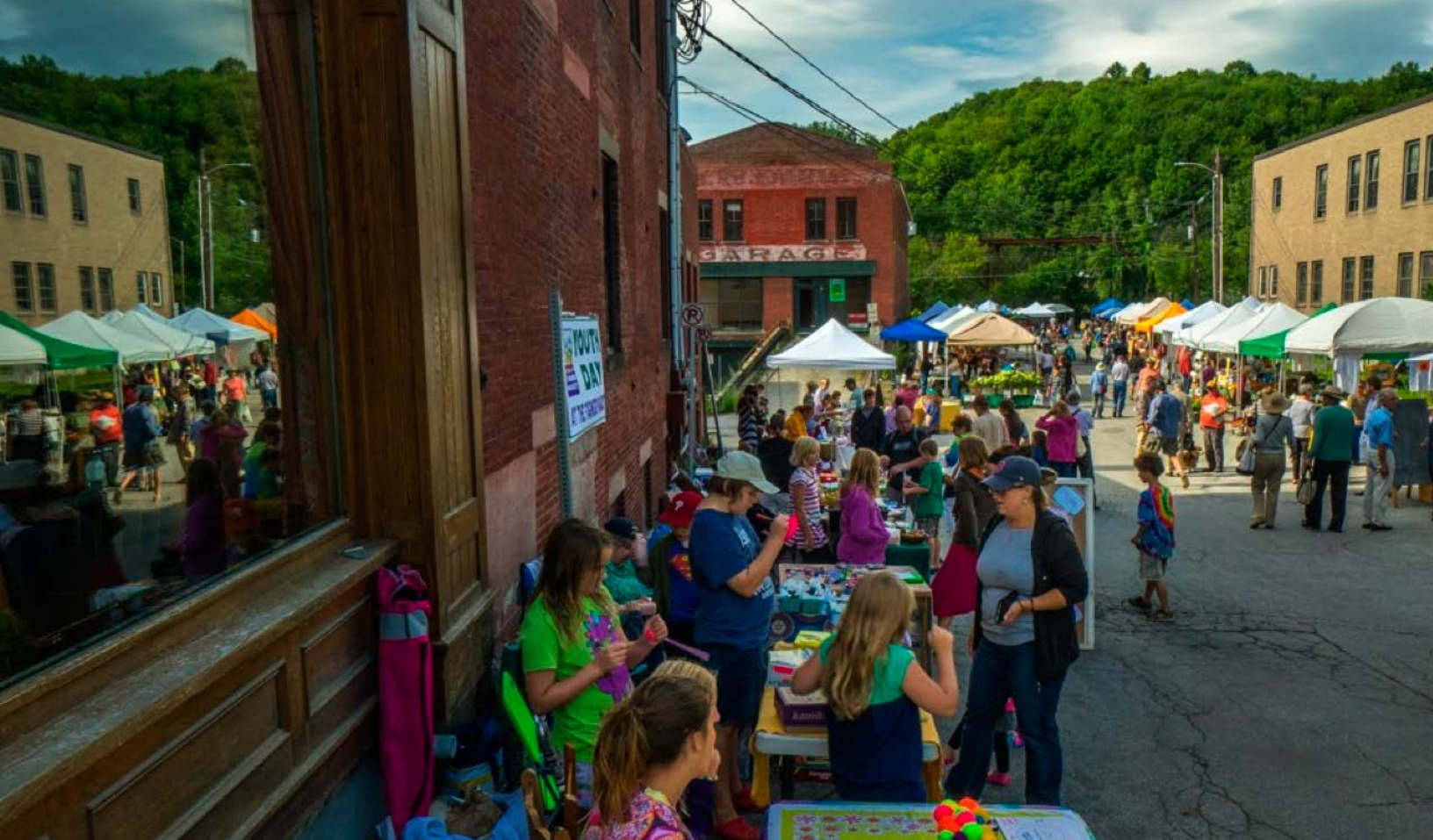
Youth day at the Capitol City Farmers Market, Montpelier, VT