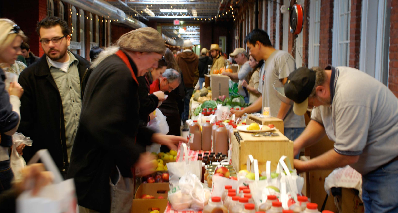
FarmFresh Rhode island moves its outdoor market indoors to create a Winter Market in a flexible industrial space.

County Farmers Market decreases from 300 to approximately 70 vendors when it relocates indoors to a senior center after the winter holidays. To keep customers interested and engaged the market hosts a community breakfast served with local ingredients.