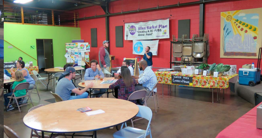
The Allen Street Farmers Market in Lansing, MI, has expanded from just an open air market on a parking lot to encompass an adjacent flexible indoor space, which used for the market, a commercial kitchen, a local food hub, and community events