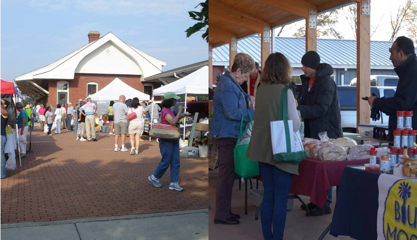
Hub City Farmers Market, old and new locations. In Spartanburg, SC, a farmers market had failed twice but on the third try, a new location at an historic train depot was selected. This proved to be such a strong location that after ten years, the market relocated again to an expanded facility with a shed and café, located two blocks away in the historic African-American neighborhood. There it continues to grow and thrive.