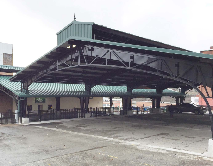
The Washington (PA) Farmers Market is relocating to a dual-level pavilion located on a downtown parking lot. The pavilion will also be used for community events.