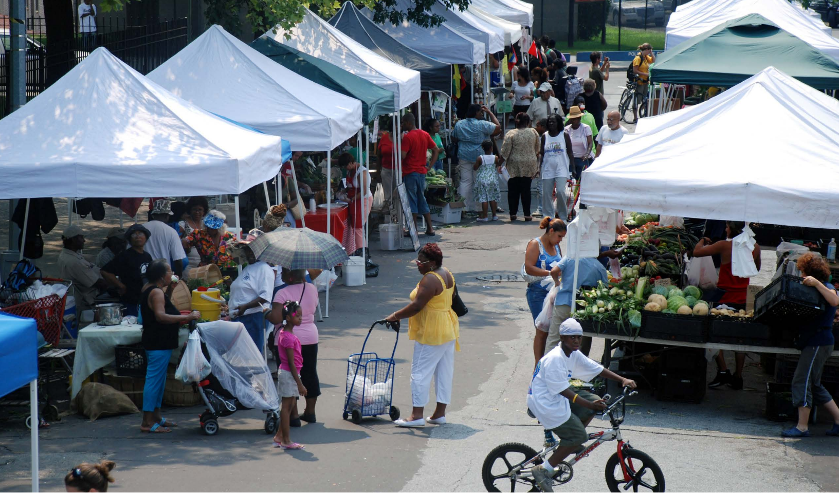
At this neighborhood farmers market in Brooklyn, local youth grow the produce in community gardens and sell it at the market, learning the value of eating more healthily in the process.