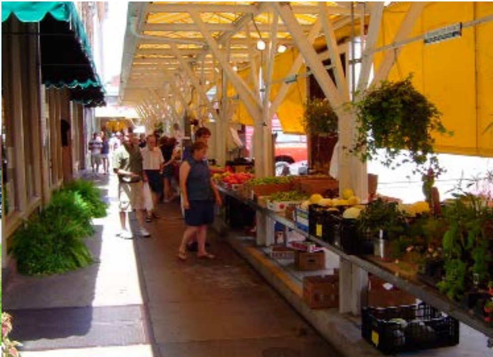
City Market, Roanoke Virginia is a curb market with brick and mortar retail on one side.