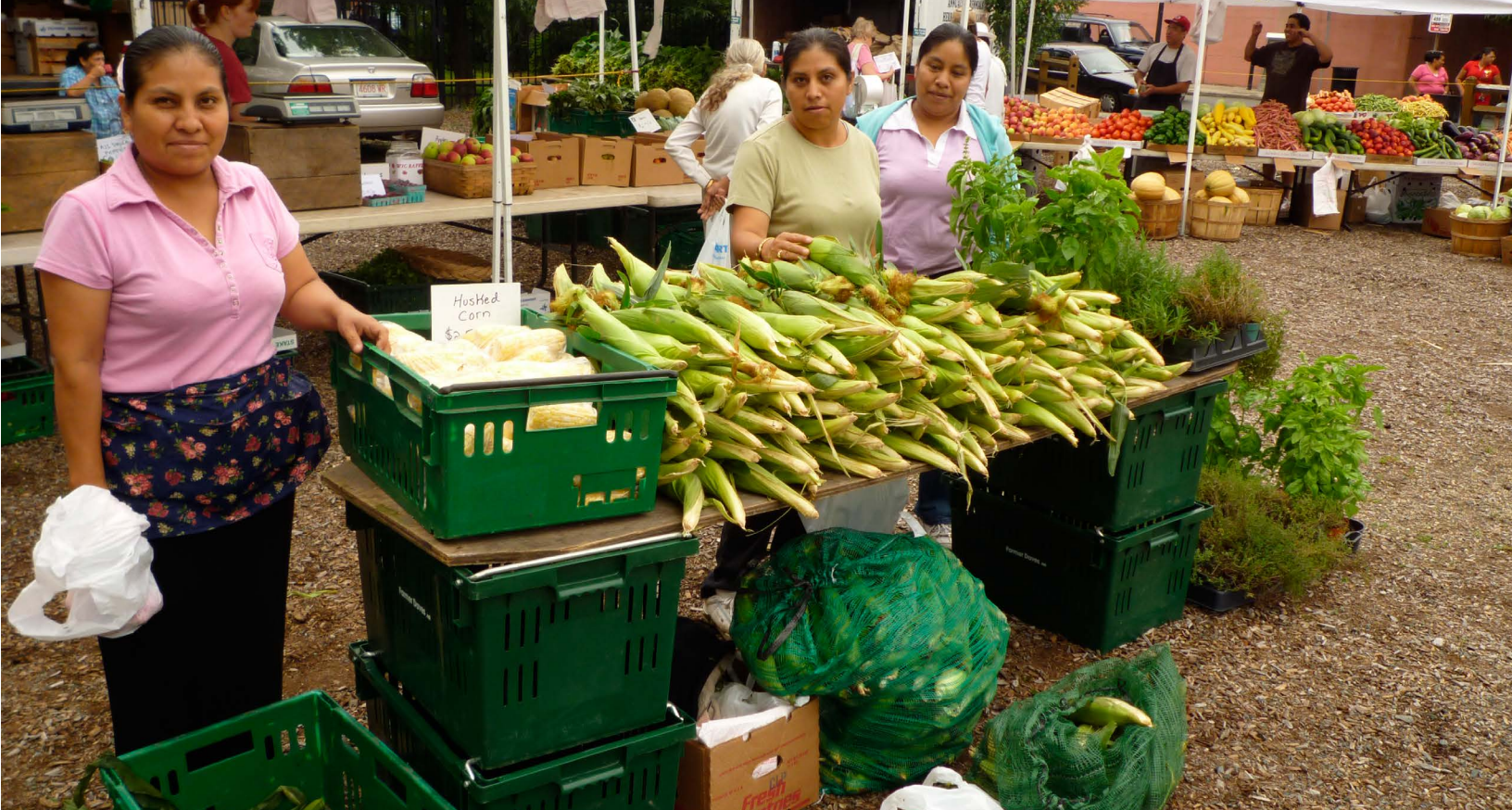
Lynn Farmers' Market, Lynn, MA